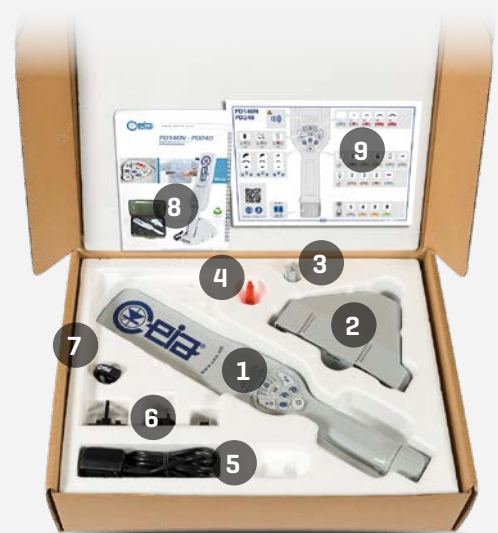
PD240 (# PD240-SET)