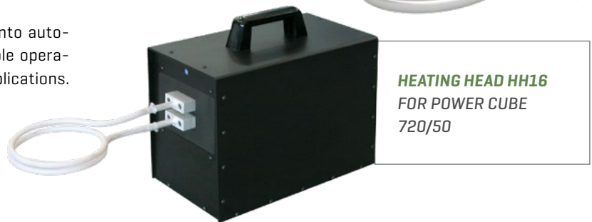
HEATING HEAD HH16 FOR POWER CUBE 720/50

* Inductors shown in the pictures as example only