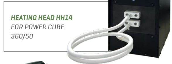
HEATING HEAD HH14 FOR POWER CUBE 360/50