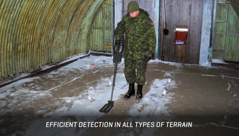
EFFICIENT DETECTION IN ALL TYPES OF TERRAIN