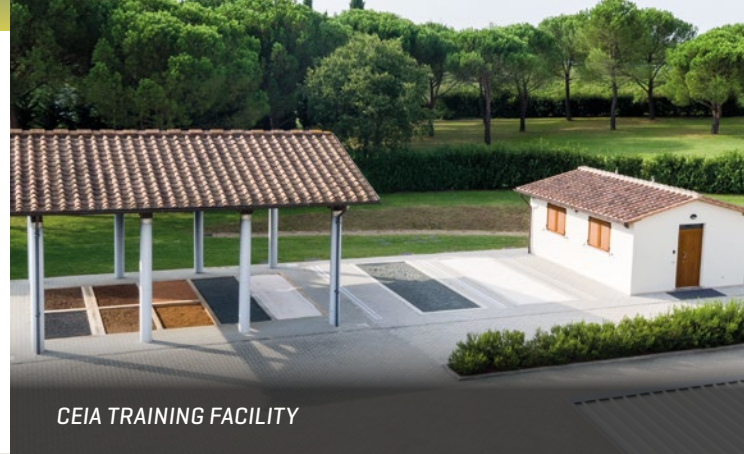
CEIA TRAINING FACILITY